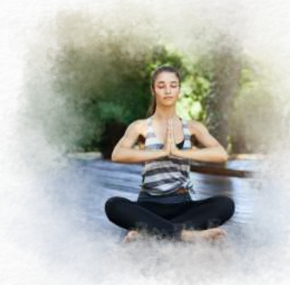
YOGA & MEDITATION PARK