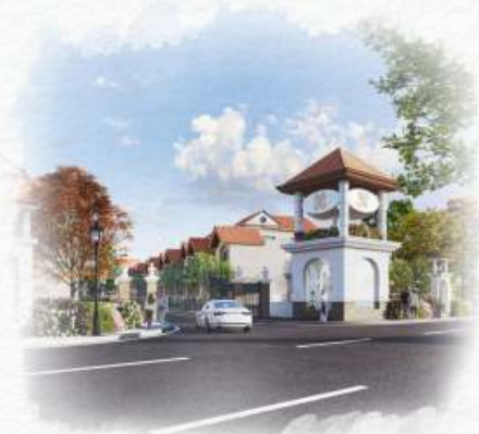
ON 60 METER WIDE ROAD